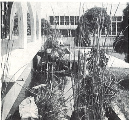
Exotic entrance to new offices

Even though there are several new buildings in this district, only one had (Continued on Page 4)