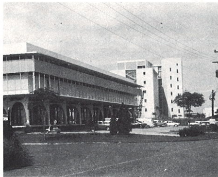
Radio Church of God Offices occupy the corner of the CCC Building