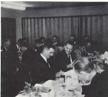
Joint meeting of Corpus Christi and San Antonio Spokesman Club

Several things have happened in the Corpus Christi and San Antonio Spokesman Clubs this month. It seems we are always doing something to have more fellowship with one another and we are very happy to be able to have this close association with one another.