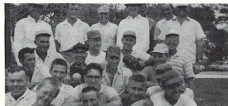
Ball players at picnic

On August 25 the Corpus Christi Church also had a record attendance. 136 were present that Sabbath. The Bible Study in the Rio Grande Valley had 39 in attendance on August 26.